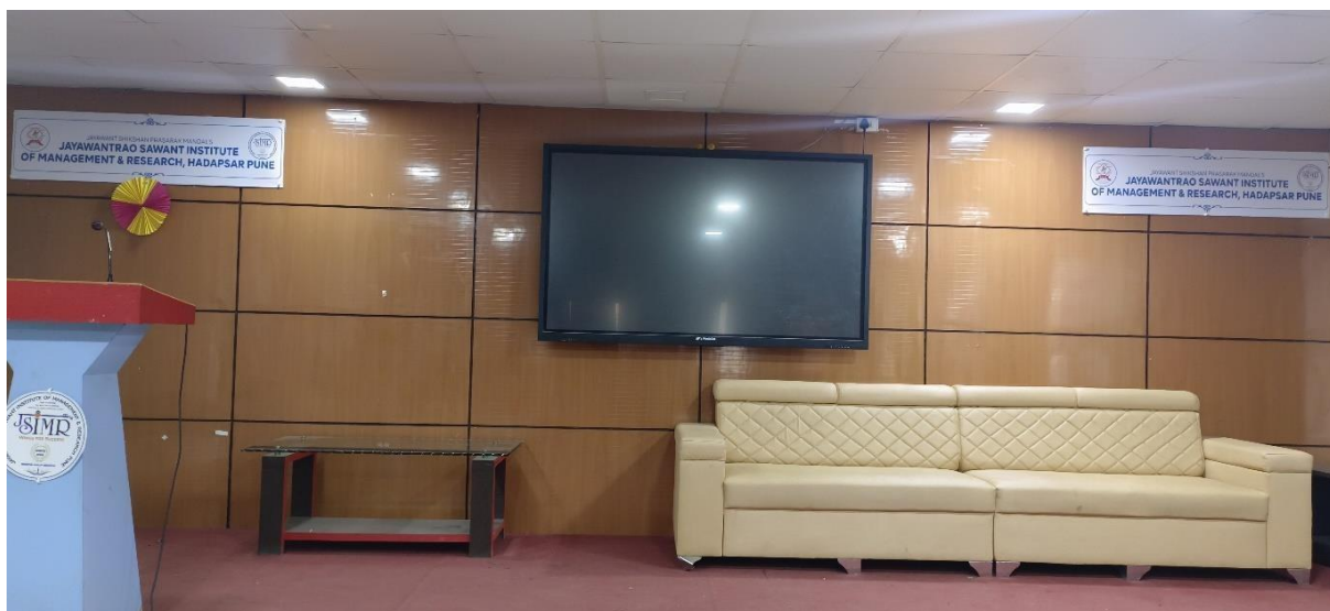
Figure 9: SEMINAR HALL