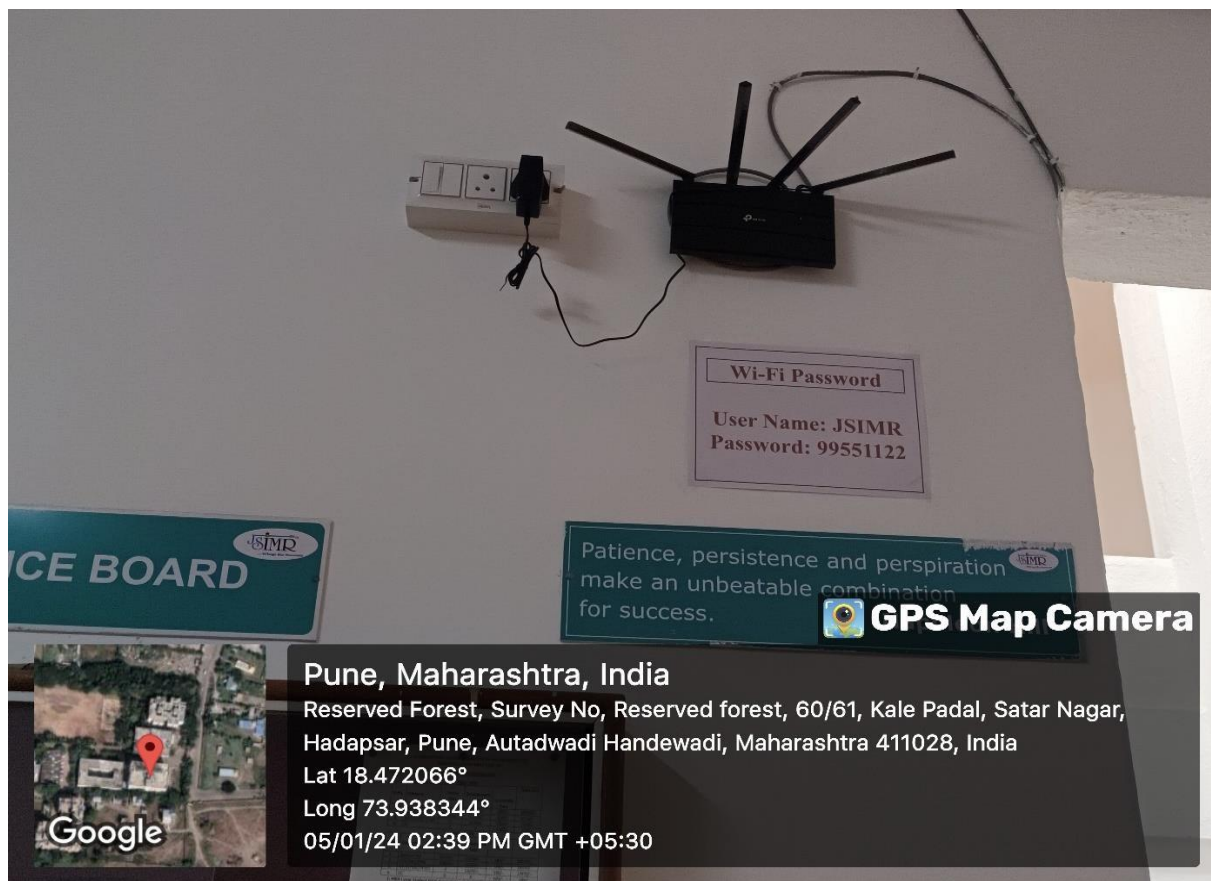
Figure 5: WI-FI CONNECTIVITY