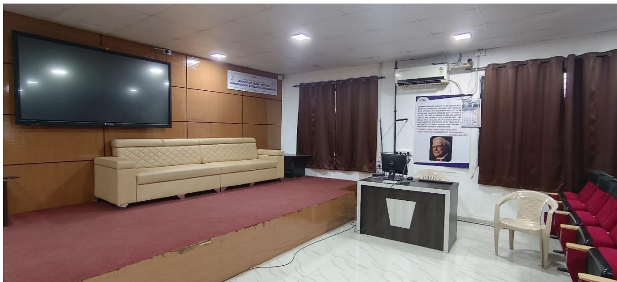
Figure 10 : SEMINAR HALL