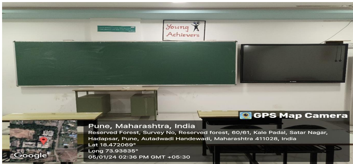
Figure 11: CLASSROOM (BLOCK 1)