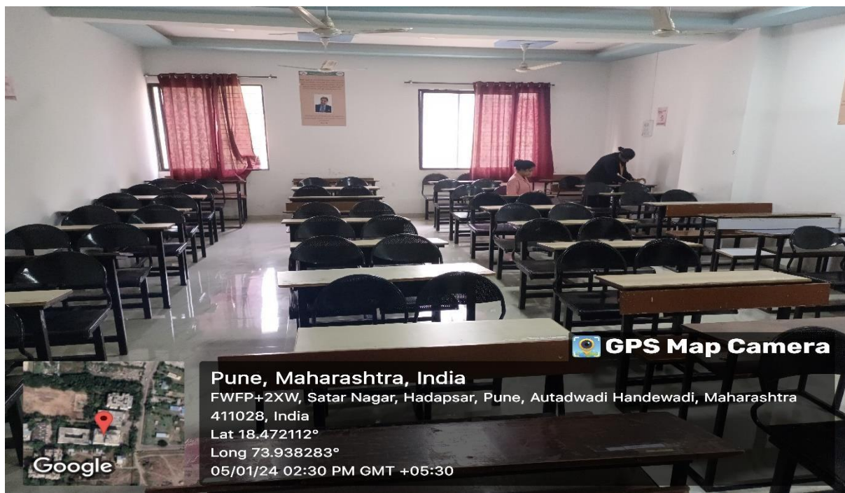
Figure 13: CLASSROOM